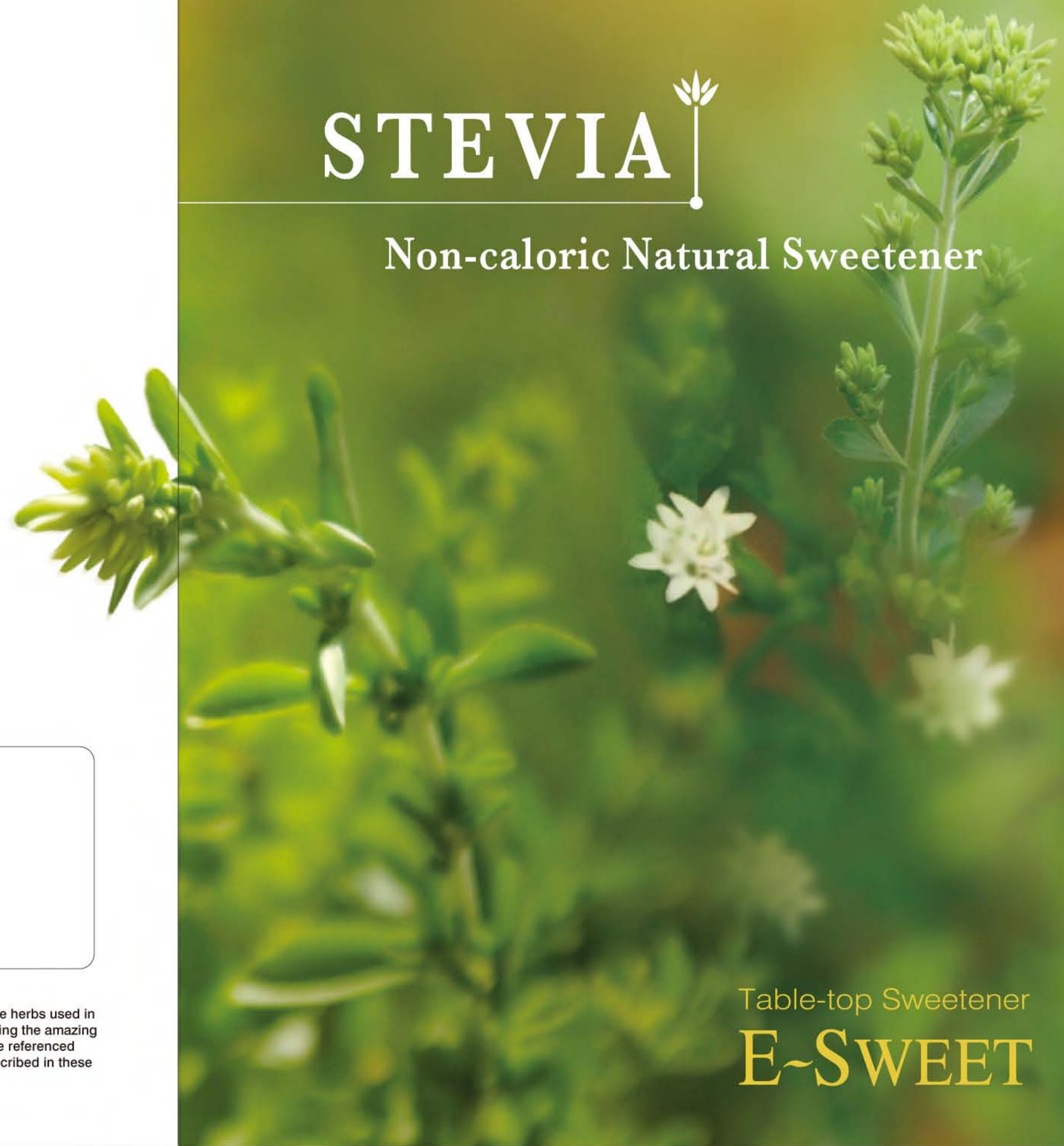
Table-top Sweetener E-SWEET