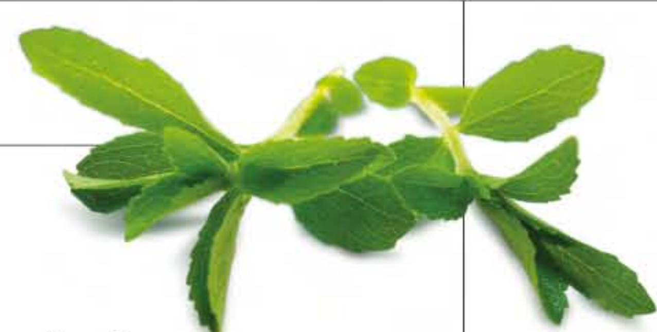
Table-top Sweetener E-SWEET